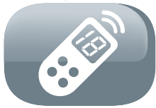
Remote control with LCD-display