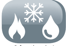
3 functions in 1