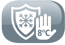
Home freezing prevention