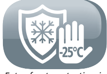
Extra frost protection in outdoor unit