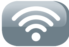
Wireless smart kit