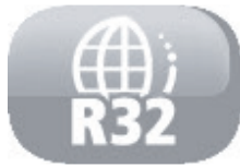
Environmental friendly refrigerant