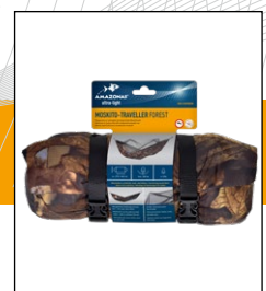
Hammock can be used on both sides - with or without the net