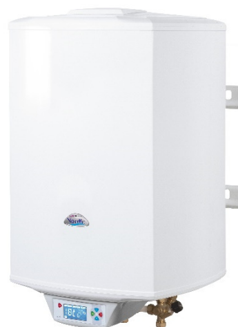
RSK 693 8088

*/in accordance with EU Commission Regulation No.812/2013